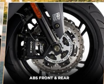
ABS FRONT & REAR