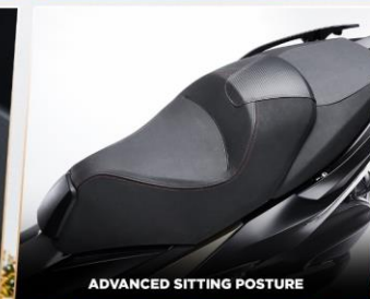
ADVANCED SITTING POSTURE