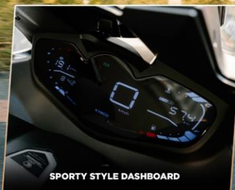
SPORTY STYLE DASHBOARD