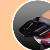
BUILT WITH OEM TOP CASE CARRIER