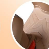
FLOOR BOARD SPACE CAN FIT A 5 GALLON WATER CONTAINER