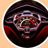
IMPROVED INSTRUMENTATION PANEL FOR HIGHER VISIBILITY