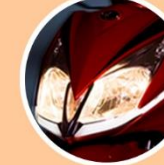
TWIN HEAD LAMP WITH H1 HALOGEN BULB AND LED PARK LAMP