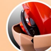
HELMET HOLDER, USB CHARGING PORT, 2 OPEN FRONT COMPARTMENT