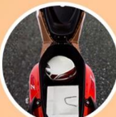
20 LITER UNDER SEAT COMPARTMENT CAN FIT 1 HALF FACE HELMET