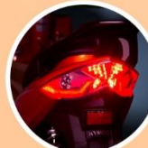
LED TAIL LIGHT FOR BETTER VISIBILITY AND SAFETY