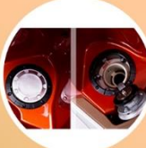
ACCESSIBLE FUEL FILLER CAP