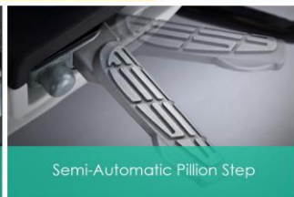
Semi-Automatic Pillion Step