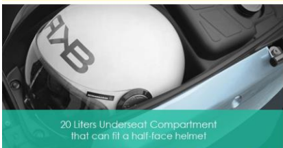
20 Liters Underseat Compartment that can fit a half-face helmet