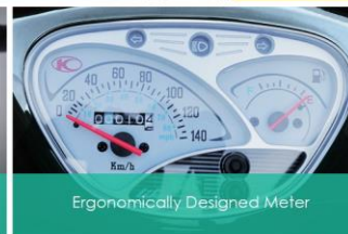
Ergonomically Designed Meter