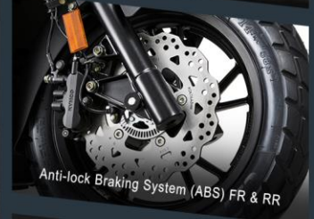
Anti-lock Braking System (ABS) FR & RR