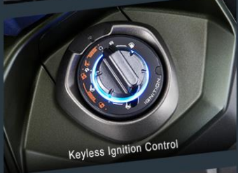
Keyless Ignition Control