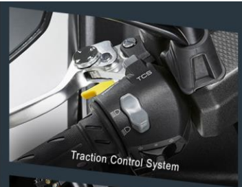
Traction Control System