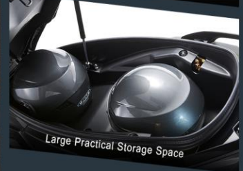
Large Practical Storage Space